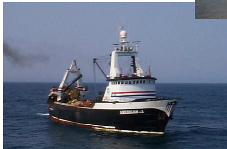
Bottom trawl catcher-processors (the 'head and gut' fleet). There are 22 vessels.

Many concerns about bottom trawling were raised such as bycatch, waste, and disturbance to habitat. A few comments from Elders: